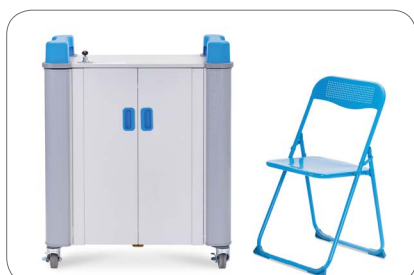
TabCabby 32H Compact